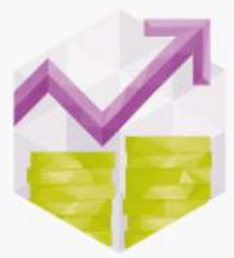
Accounting, Finance & Economics

Journals, books and case studies - a library of real world research at your fingertips