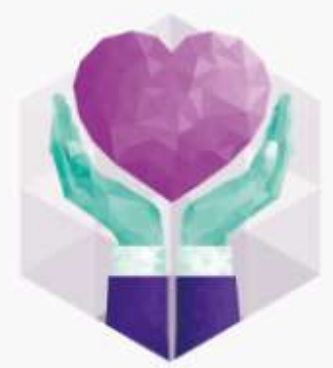
Health & Social Care