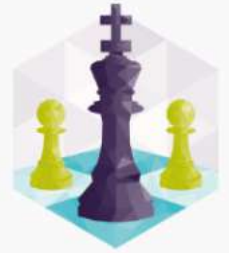
Business, Management & Strategy